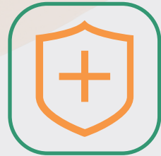
Silicone protective case