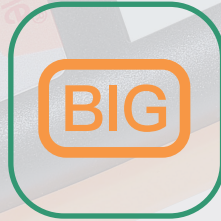
Super long standby