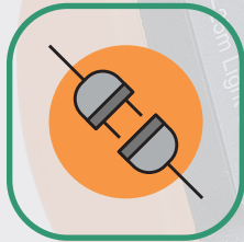
Plug and play