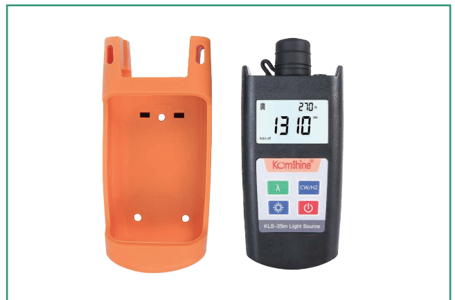
Detachable protective sleeve