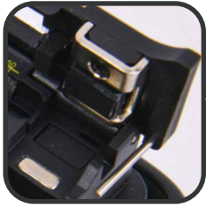
Oven with Removable SOC Clamps