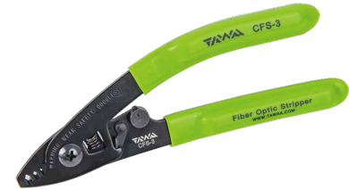
3-hole Miller Stripper