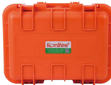
(Standard Configuration) Carry Case