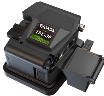
Fiber Optic Cleaver