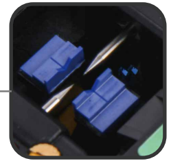
Ceramic V-groove Design