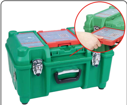
(Selective Configuration) Multi-function Carry Bag