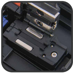
Special 3-in-1 Fiber Holder