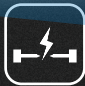
4000 Times Electrode Life