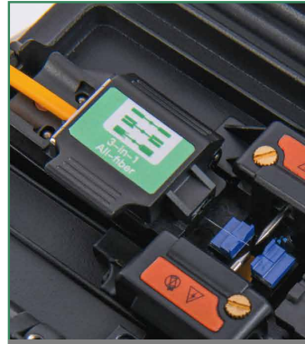
3.0mm Jump Fiber