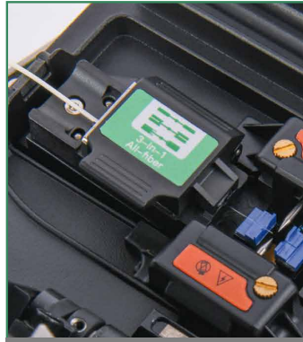
0.9mm Pigtail Fiber