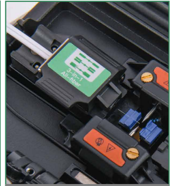
FTTH Flat Fiber