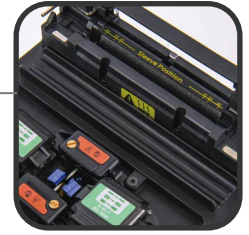
Integrated Cooling Tray