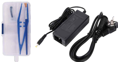
Spare Electrode+Power Charger